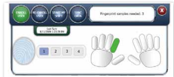
Step by step instructions on enrolling a user

From one side of the world to the other, from the corporate office to a satellite office, our system connects them all together. Remote access to these systems is Windows authentication protected. The DigiClock system allows a central computer in your human resources department to handle any changes that need to be made.