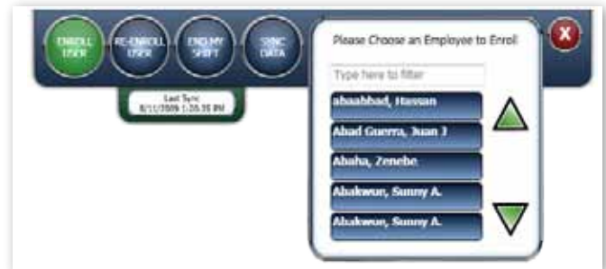
Manager enrolling a user for the first time

Employees will be paid exactly what they're owed, payroll administration costs will plummet, and the new system will eliminate messy timecards and time sheets. Traditional identification methods, such as badges, PINs (personal identification numbers), and passwords don't accurately authenticate the individual since these devices are easily transferable. Only biometric readers authenticate people by unique, unalterable physical characteristics.